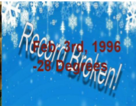
The record cold had students with no school on Wednesday and Thursday.