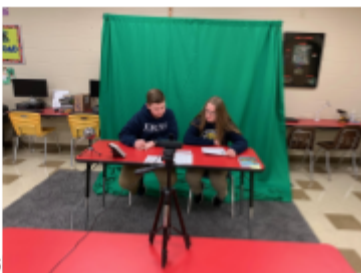
Students broadcast live to the school in front of the green screen.

activities. Two students are picked for a week. Search for the Jordan news channel on Youtube to experience these awesome announcements.